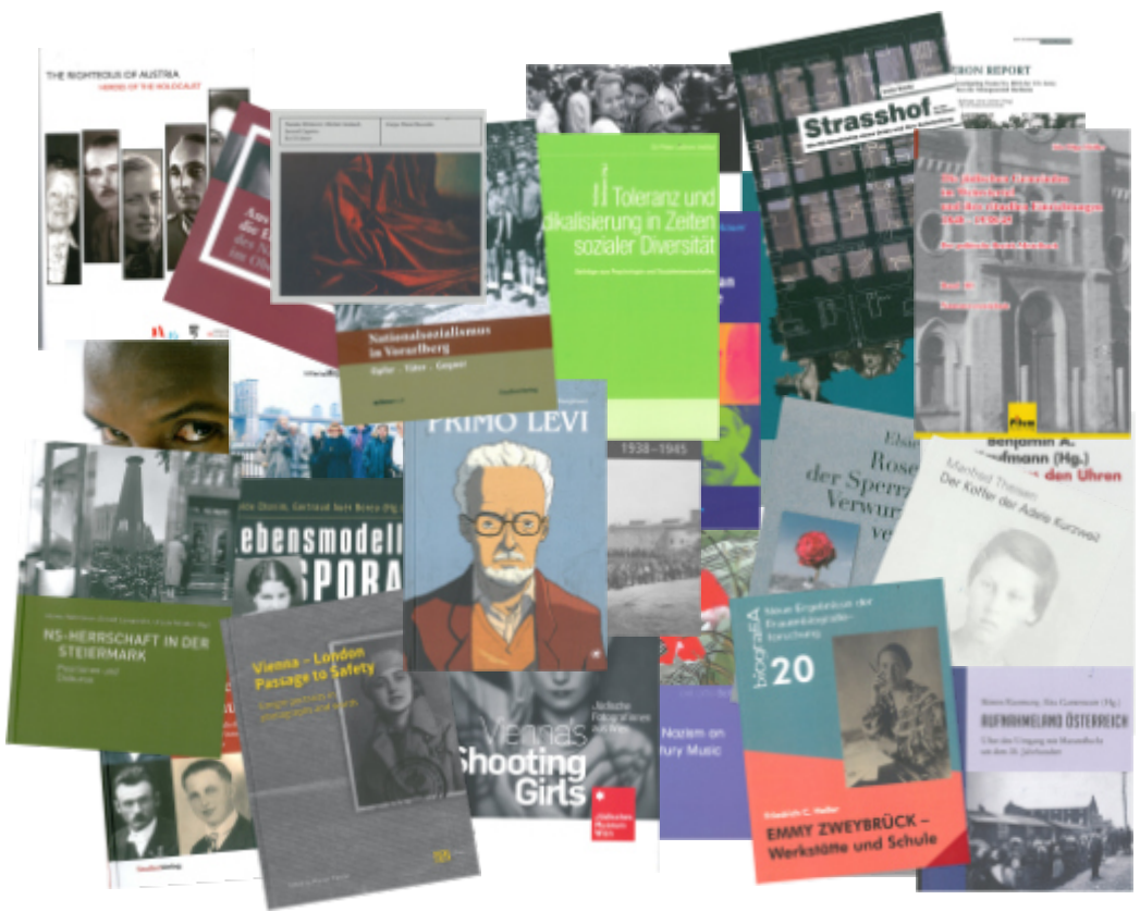
Impressum: Zukunftsfonds der Republik Österreich, Schwarzenbergplatz 1, A-1010 Wien